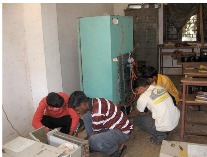
Refrigeration and Air conditioning Mechanic students of our institute at Siolim