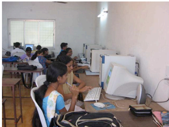
Computer Operator and Programming Assistant (COPA) students of our institute at Siolim