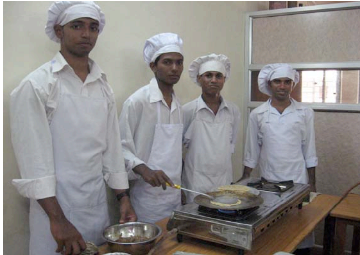
Catering students doing practical during their training in our institute Keerti Vidhyalaya Technical Institute, Siolim